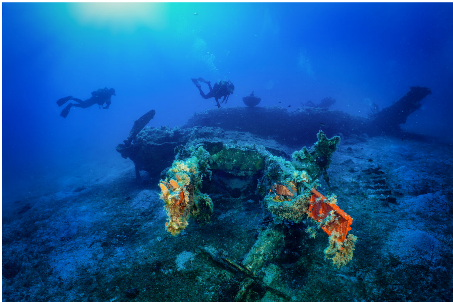
A scuba diver explores a sunken World War Two fighter propeller airplane on the seabed of the Aegean Sea, near the island of Naxos, Greece