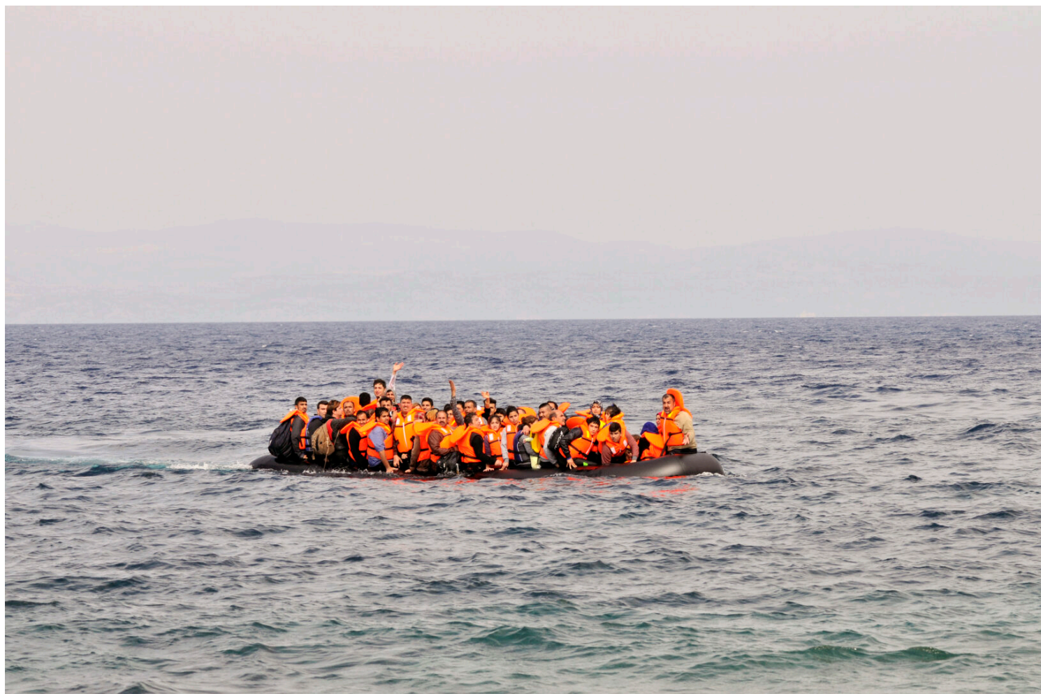
The refugee drama hits Europe. In the image, Syrian, Afghan and African refugees arriving in Lesvos after leaving Turkey. April 2016.