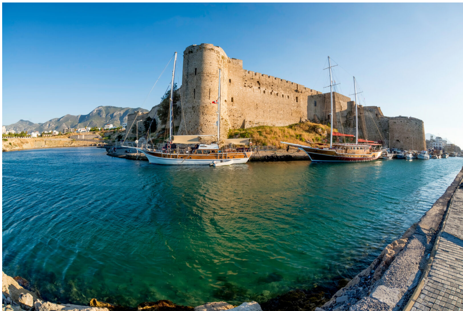
Medieval castle in Kyrenia, Cyprus.